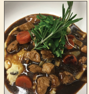
Pork ragu with creamy mushroom polenta