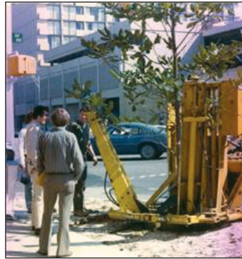
"Maggie" the magnolia tree, standing approximately 12' tall, when planted in the early 1970s. Today, she is as tall as our building and provides shade to cover most of the new 525 sq. ft. patio.