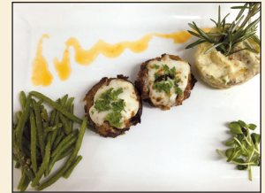
Veal meatloaf with mashed potatoes & green beans